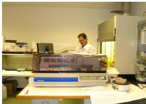
New BSL2 lab facilities with well equipped common lab.