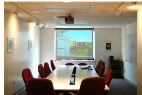
Large, well equipped conference room. Complete business library with AV equipment and online databases. (not shown)