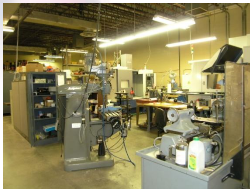
Open manufacturing areas with CNC capabilities